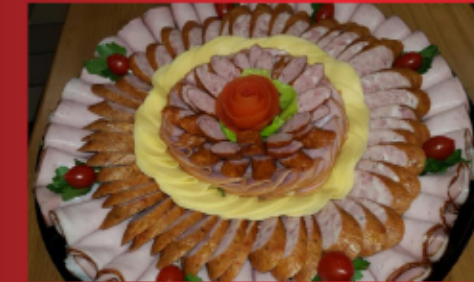
Ham and Sausages Tray Large - $45.00 • Small - $35.00

Cream Cheese, Polish Cheese, Tomato, Radish, Pickle, Green Onion