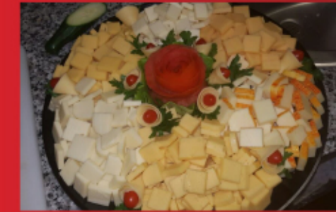
Cheese Tray Large - $45.00 • Small - $35.00