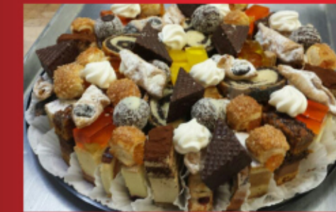
Cake Tray Large - $45.00 • Small - $35.00

Salami, Polish Ham, Polish Cheese, Cream Cheese, Red Peppers