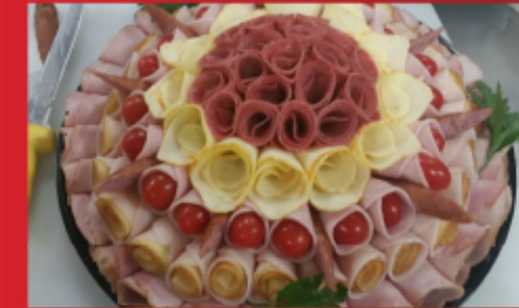
Meat-Cheese Tray Small - $35.00 • Large - $45.00